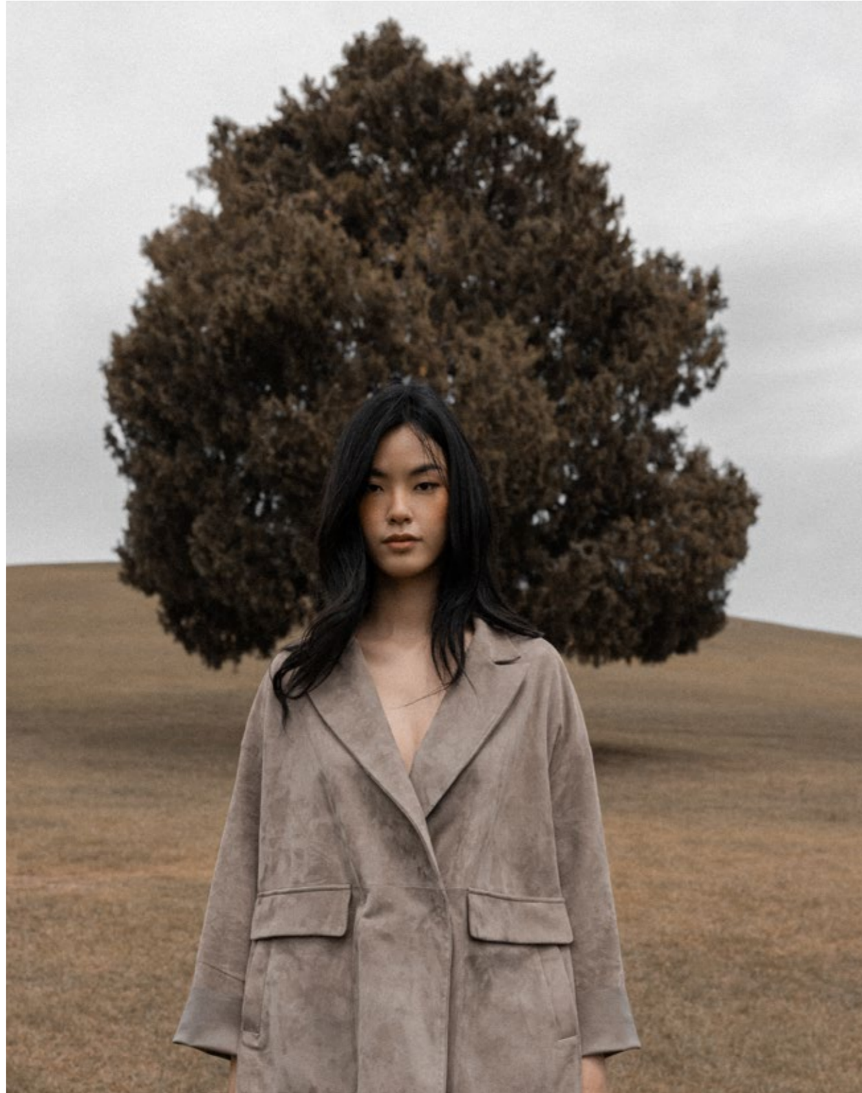
THE SILENCE OF THE VAST PLAIN, A YOUNG BODY IN THE WIND – BAREFOOT, LOST, BORN.